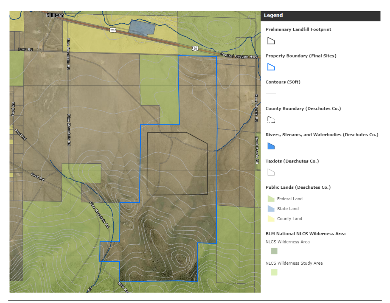
Figure 4. Roth East Site Map

See Appendix D for Site Owner Solicitation Responses with terms and prices for acquisition.