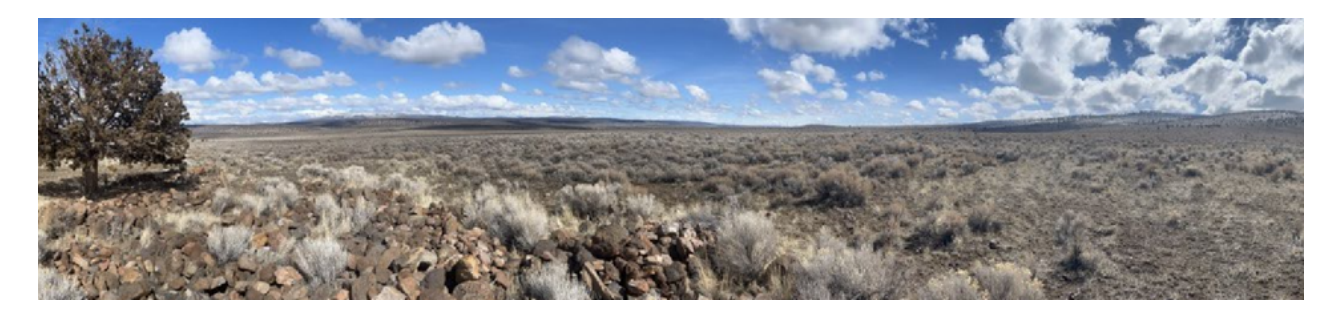
Figure 5. Roth East Site Photo