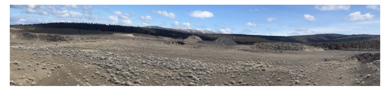
Figure 3. Moon Pit Site Photograph