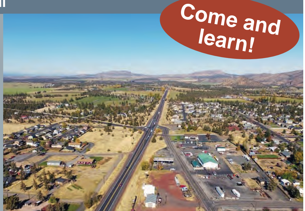
Meet with the Terrebonne Sewer Advisory Group, County representatives, and civil engineers involved in the sewer planning effort.

Deschutes County and the Terrebonne Sewer Advisory Group invite residents and businesses within the unincorporated boundary of Terrebonne to learn more about the findings of the Feasibility Study and potential next steps to form a Sanitary District and provide sewer service to the community, starting with the Commercial Core.