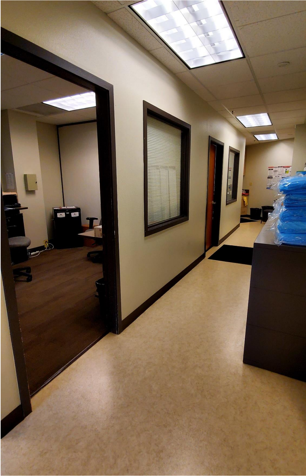
Entrance to clinic nurse manager’s office. Second door on left is entrance to practitioner office.