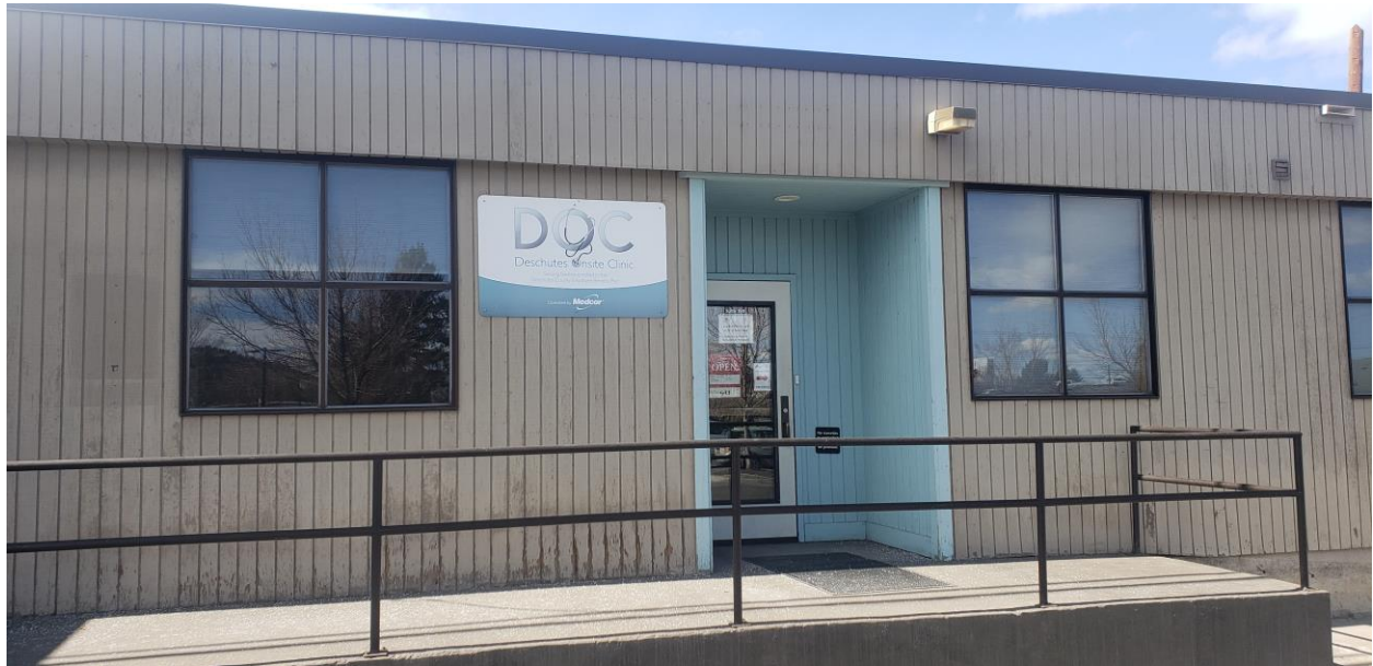
Exterior with opportunity for signage