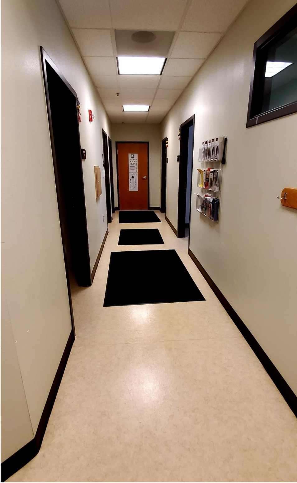
Hallway to 3 exam rooms and 1 small lab and bathroom.