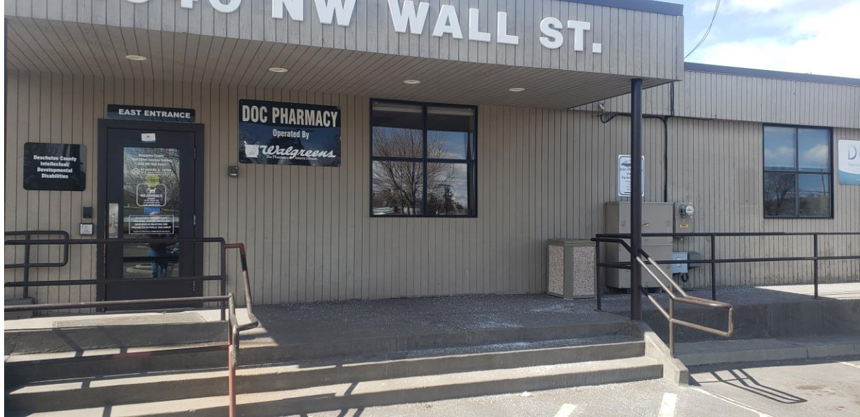
Exterior with opportunity for signage.