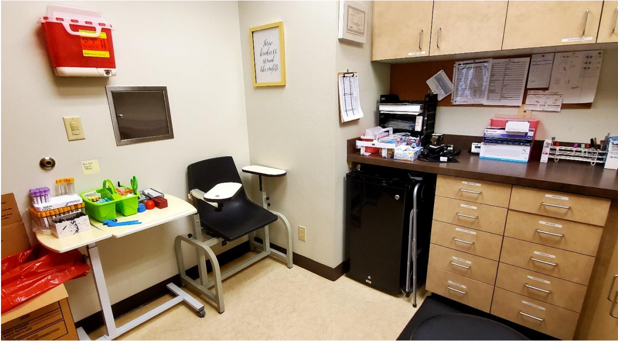
Patient station in the lab.