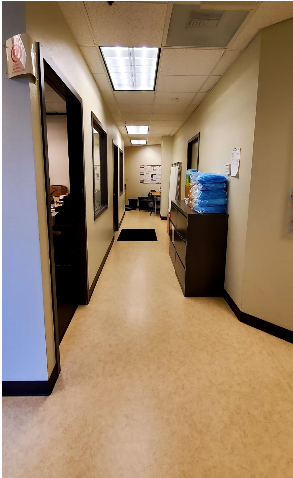
Hallway to staff offices and small break area. First left is the clinic nurse manager office with refrigerated storage and files. The second left is the practitioner office with two desk. A small break area at the end of the hall.