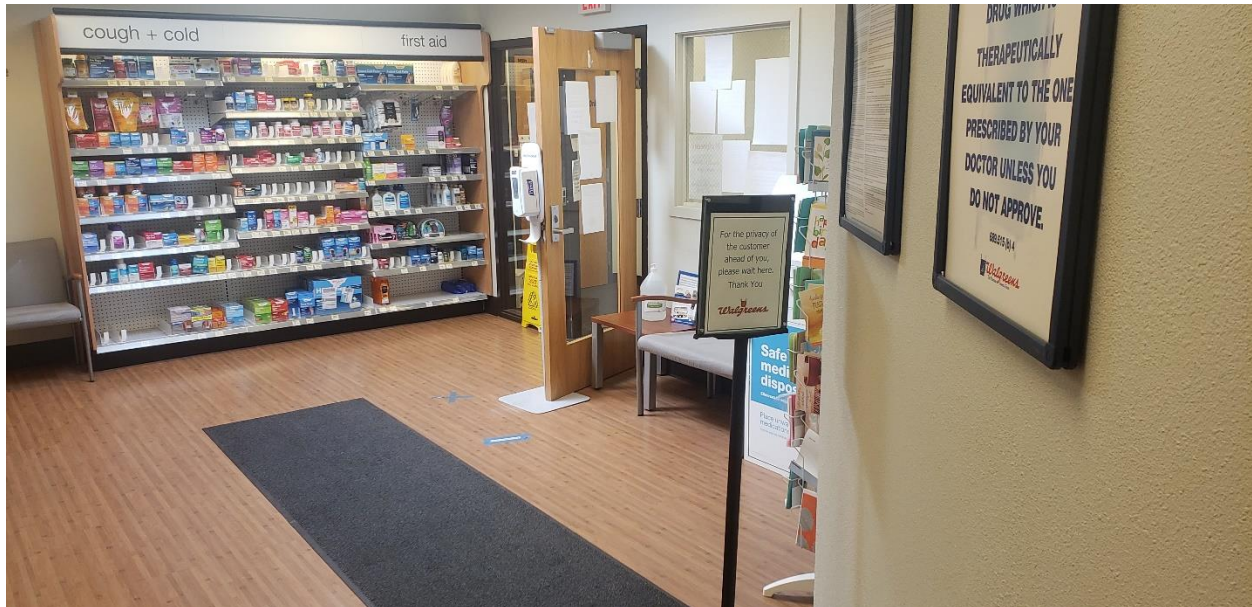
This is a photo of the DOC Pharmacy lobby taken from in front of the dispensing counter. To the left of the retail wall is a separate consultation/immunization room. Directly behind is a two station dispensing counter and a large pharmacy drug storage area behind a security door. Bathroom is located in the back of the secure drug storage area.