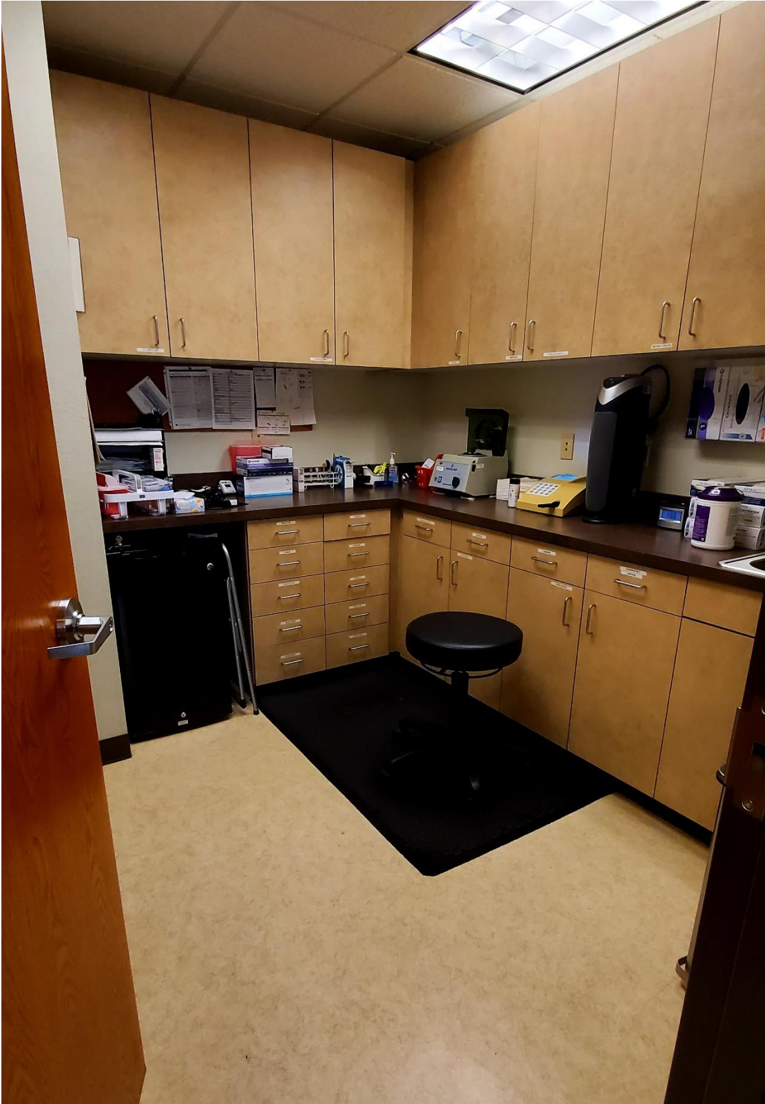
View of lab from door.